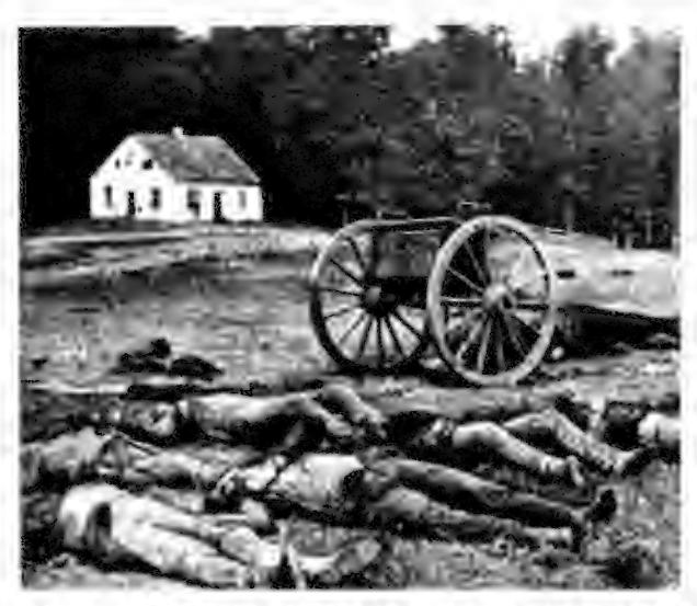
MILENCED CONFEDERATE BATTERY IN FRONT OF BUNKER CHURCH SHARPSBURG ROAD, ANTIETAM

This little brick church lay between the opposing lines, and both Union and Confederate wounded were gathered in it.